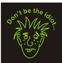
Logo for the Party Wise campaign.

"Since referring an 11yo client involved in the youth justice system to the foundation and them following through and ensuring that he was not only enrolled in a club, but included, I have seen a dramatic change in his attitude, behaviour and the peer group that he associates with. He appears much more enthusiastic and the behaviour that he was engaged in prior to the referral has decreased significantly."