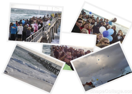
4th May 2010 - Anti-Violence Walk, Port Noarlunga Jetty

There were none brave enough to take the plunge off the jetty this year - although some came prepared - but we look forward to a brighter day and bigger crowd next year.