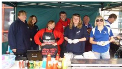
Volunteers at Bunnings Marion - 19th June 2010