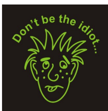
Logo for the Party Wise campaign.

Thank you to Bendigo Bank Morphett Vale for their support and generous donation towards the play. We will be holding a website poster competition in conjunction with the play performances. The winner will receive a prize courtesy of Bendigo Bank.