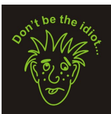
Logo for the Party Wise campaign.

In February Somerton Surf Lifesaving Club hosted 12 young people at a Come'n'Try day. Our group was treated to a tour of the