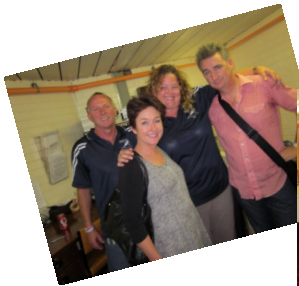
Comedy Gala 2011

Keep an eye out for next year's show - tickets will sell fast!