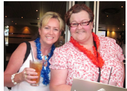
Bali Night at the Highway