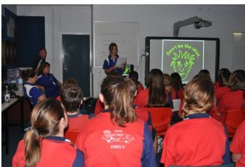
Yorke Peninsula Road Trip

Impact – Raising awareness about the consequences of choices.